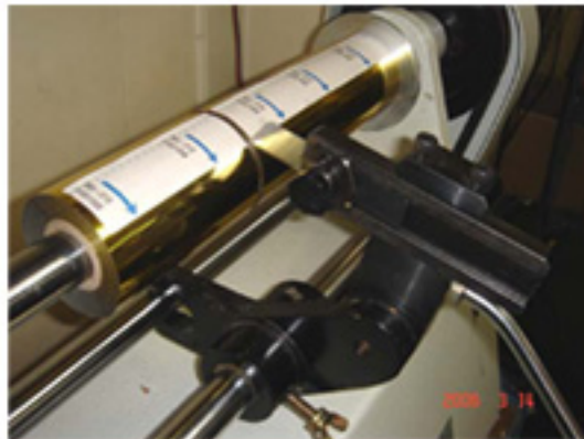
SNAP OF CUTTING BLADES